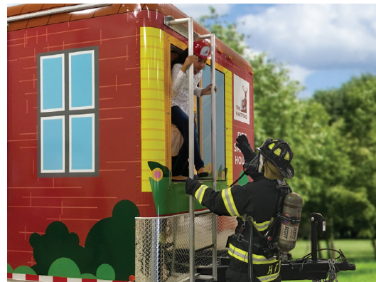
The Hartford's Fire Safety House: Simulated fire and smoke demonstration to help educate students on fire safety that will travel to select cities identified by the fire index.